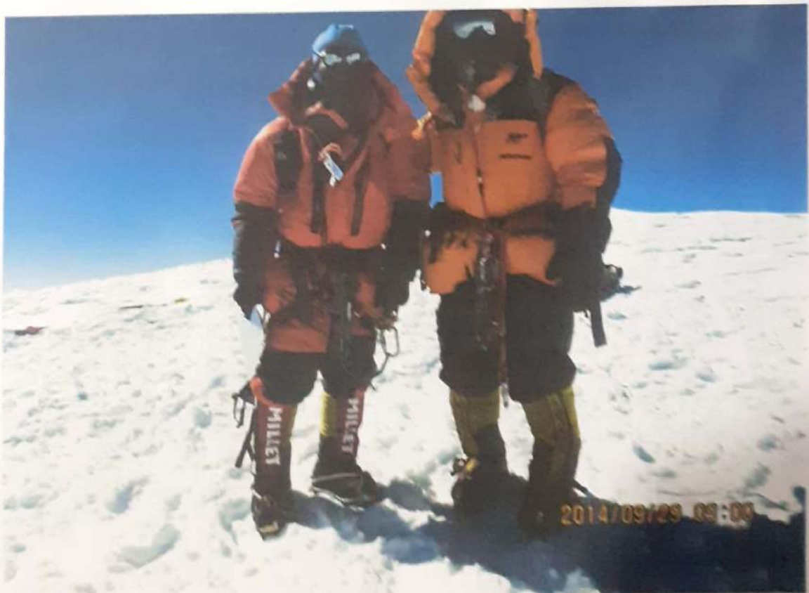
Mt. Cho- Oyu 8201m