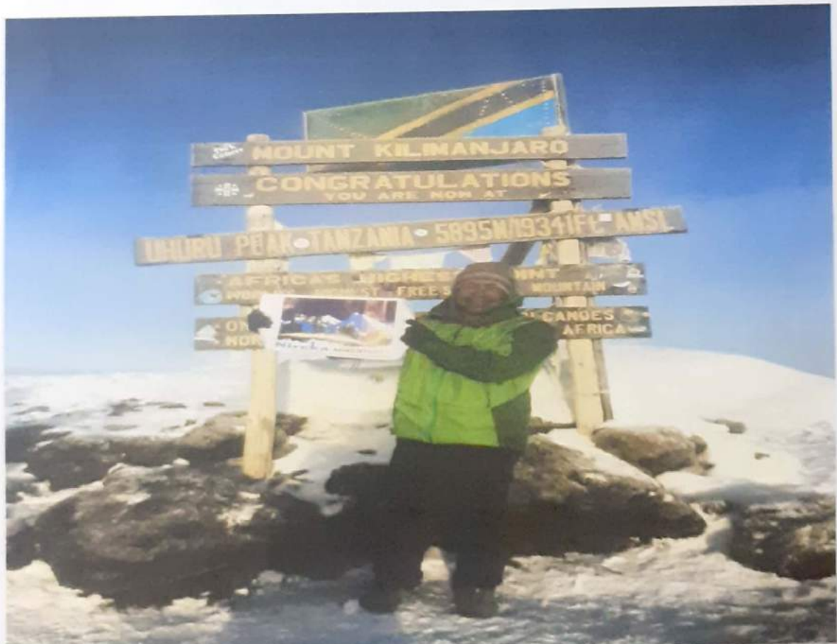
Mt. Kilimanjaro 5895m, Tanzania