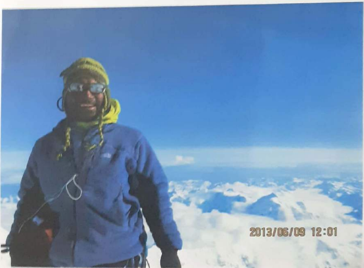
Mt. Denali 6217m USA