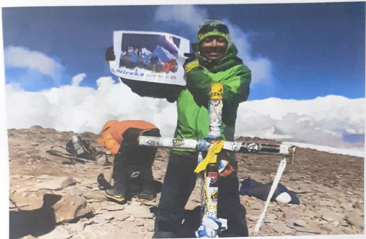
Mt. Acancugawa 7000m, Argentina