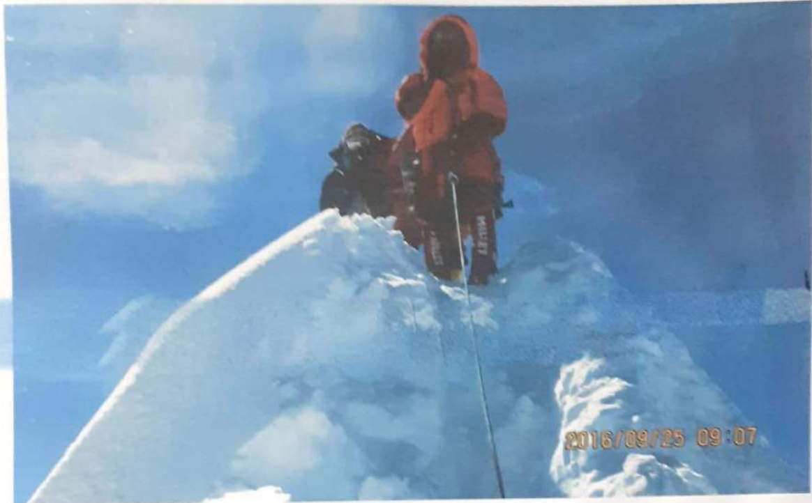
Mt. Manaslu 8167m